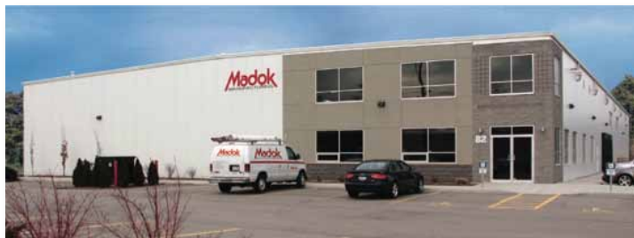
The Madok plant in Brantford, Ontario

Each HERESITE® corrosion protection solution is a combination of a superior coating product - proven over years of use in the field across a wide variety of the most demanding operating environments – that can be tailored to meet the unique requirements of specific industry applications, AND Madok's consistently superior level of customer service that produces unsurpassed customer benefits.