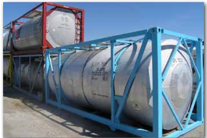
Heresite lining protects iso-tanks from harsh chemicals.

We offer both heat cured and cold set coating and linings including phenolics, epoxy phenolics, epoxies, and urethanes. Our linings are designed for extreme immersion service with resistance to acids, alkalines, and high salinity environments. They are resistant to high and low pH environments and most meet FDA requirements of 21 CFR 175.300.